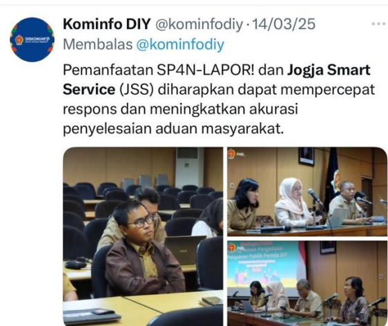
Figure 1. Example of X content

audiences. In addition, a one-stop service system and a single data concept are implemented to ensure the accuracy and consistency of information disseminated through various channels.